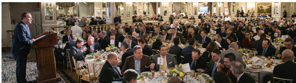
2017 Annual Membership Meeting & Construction Industry Luncheon