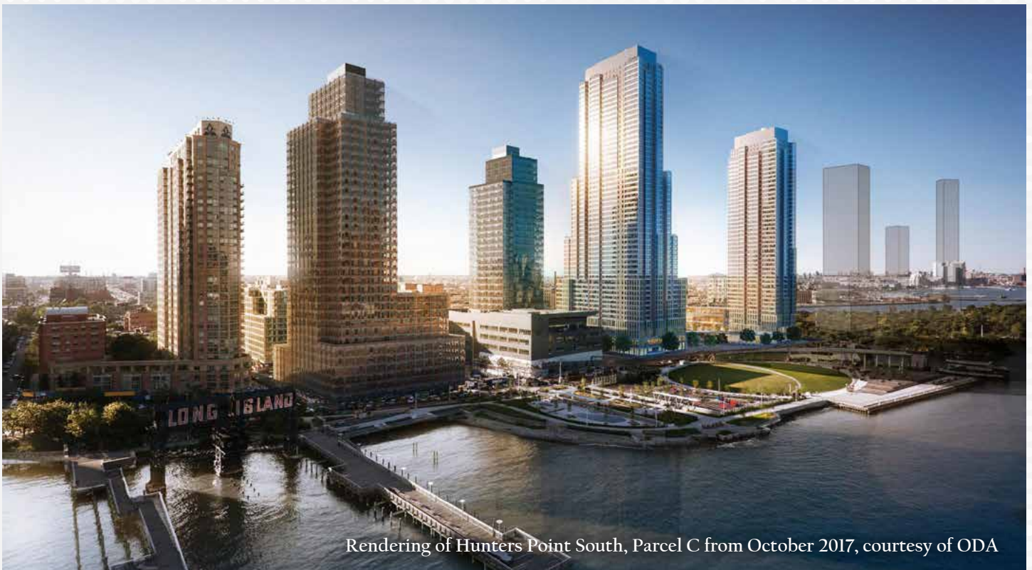
Rendering of Hunters Point South, Parcel C from October 2017, courtesy of ODA

For the Port Authority of New York and New Jersey, upcoming projects at JFK and LGA, including the AirTrain addition and continued runway and roadway improvements will spur construction for several years. Assuming the majority of high-value