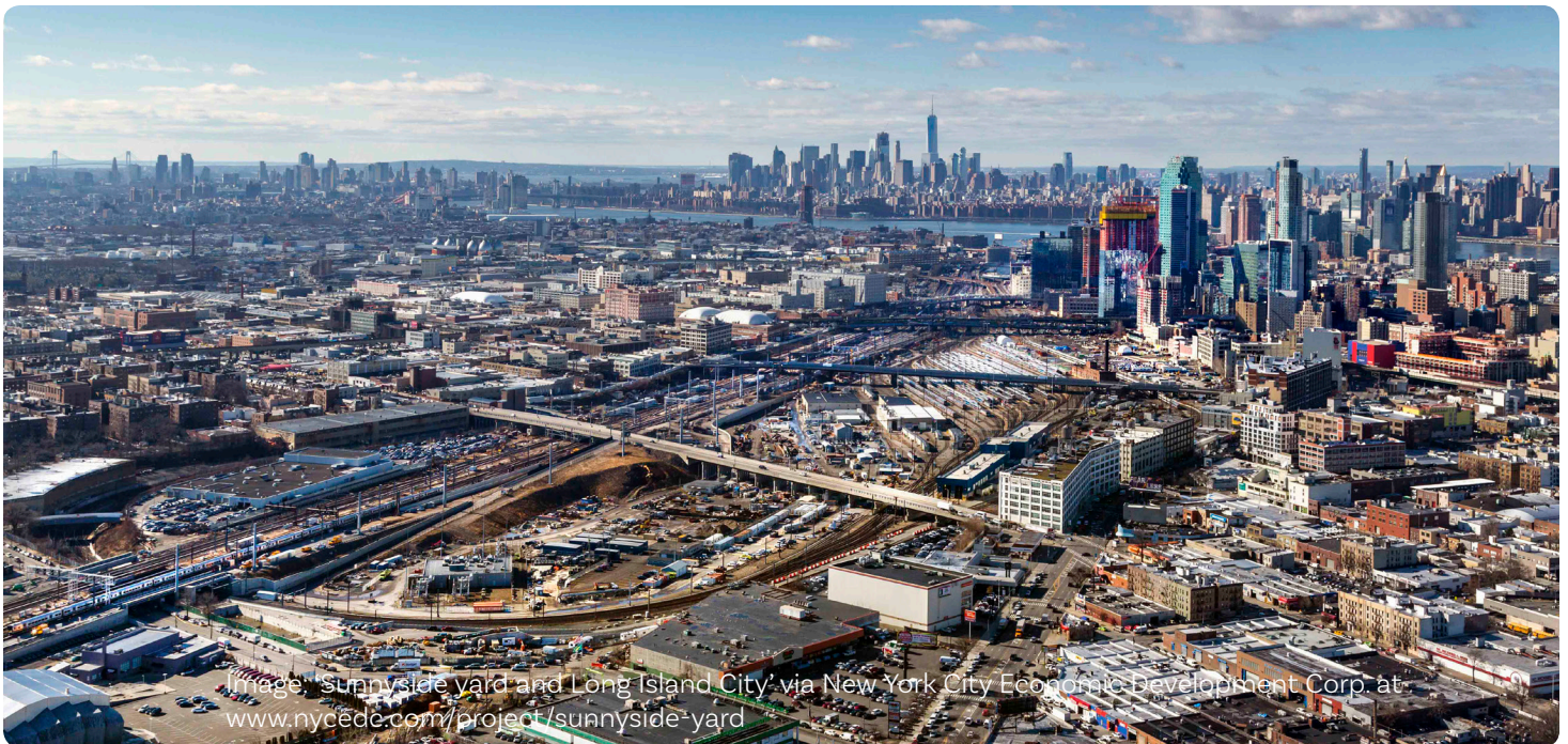
Image: Sunnyside yard and Long Island City via New York City Economic Development Corp. at www.nycedc.com/project/sunnyside-yard

The Building Congress will work with the de Blasio administration, elected officials and local communities to support future rezoning initiatives and turn their collective vision into reality.