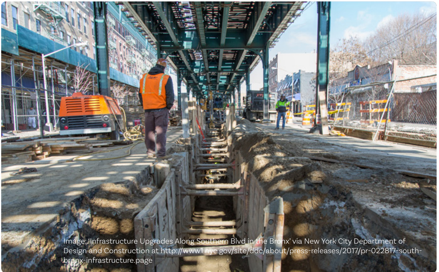
Image: 'Infrastructure Upgrades Along Southern Blvd in the Bronx' via New York City Department of Design and Construction at http://www1.nyc.gov/site/ddc/about/press-releases/2017/pr-022817-south-bronx-infrastructure.page

The Building Congress will work with the City to look closely at its programs and practices, suggest areas for improvement, and seek their implementation.