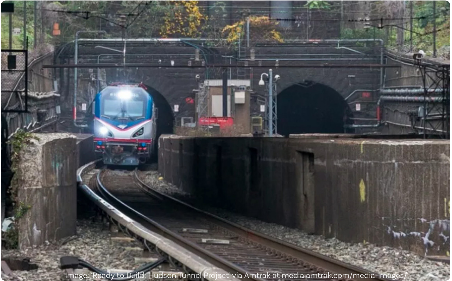
Image: 'Ready to Build: Hudson Tunnel Project' via Amtrak at media.amtrak.com/media-images/